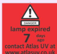
Lamp change warning