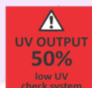
Low UV warning screen