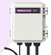
Solenoid Connection Module