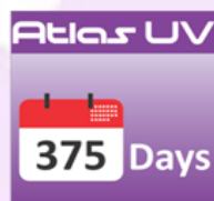
Lamp life remaining