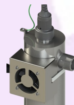
Temperature management fan