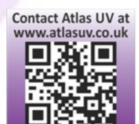
QR code screen